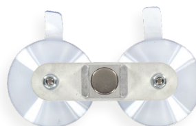
Suction cup fastening